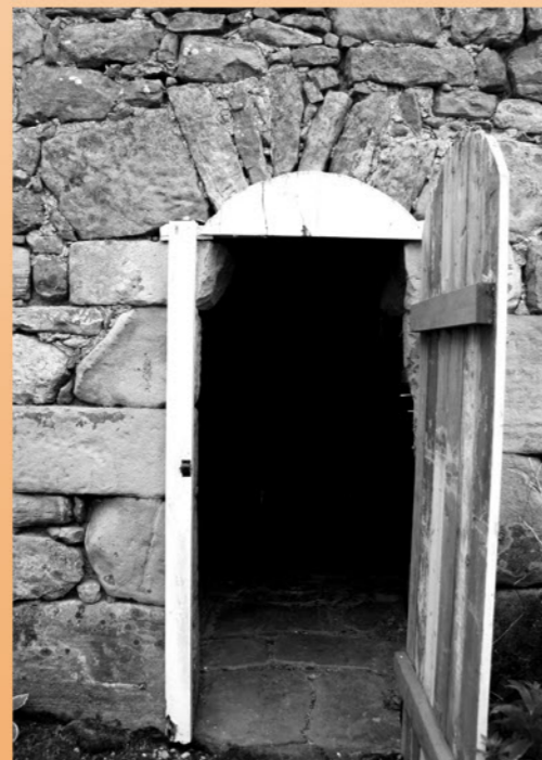
North Gatehouse, doorway with relieving arch to reduce loading on the lintel