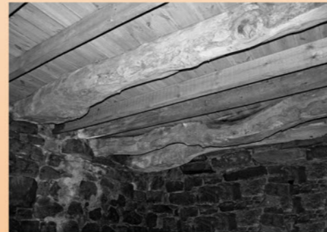
North Gatehouse one of very few Tasset bastles showing traces of ground floor stone vaulting

The ground floor of bastles had a single narrow doorway, usually set in an east or west gable end, and a few narrow slits for ventilation. Double doors were common and usually harr-hung, i.e. pivoting on a post set into sockets on the threshold and the lintel. They were secured from within by strong drawbars, slotted into the masonry.