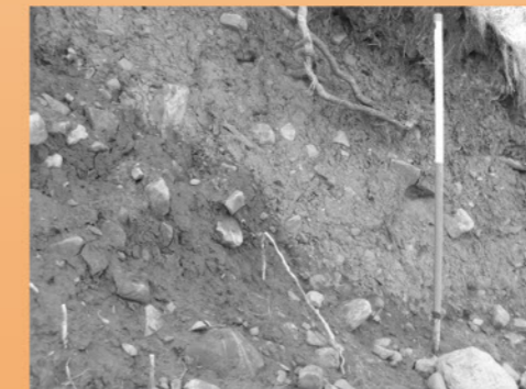
Glacial Till exposed in bank of Tasset Burn; generally good foundation material, but can shift under weight of walls