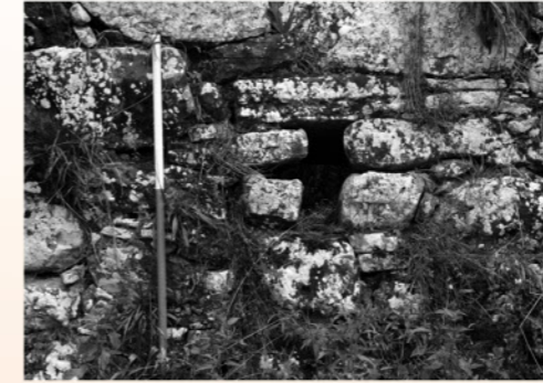
Boghead ventilation slits