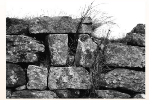
Hollinhead ventilation slits