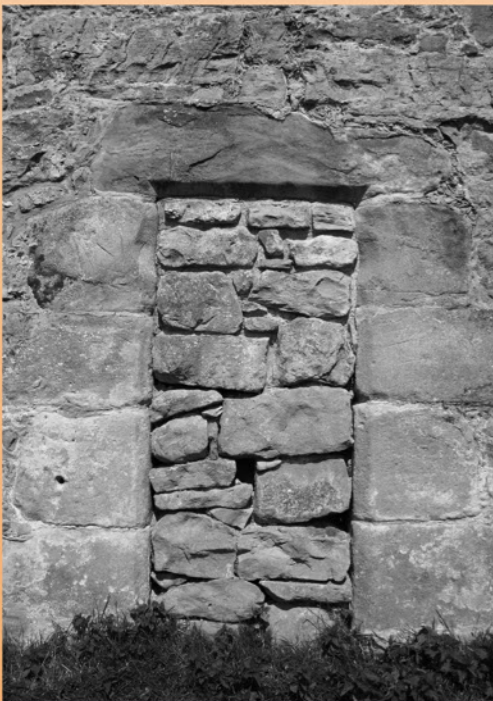
Black Middens, doorway chamfered margin, substantial lintel; door jambs particularly massive, in uniform grained sandstone