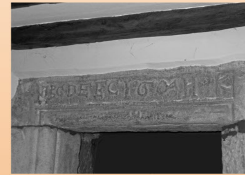
Falstone Farm enigmatic inscription ABCDEFG1604HJK above well-made, roll moulded doorway