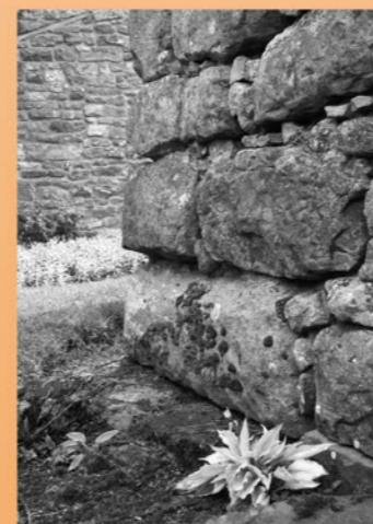
North Gatehouse spread foundation (base course wider than walls) used to improve stability, marginally reduces bearing pressure

No dates are recorded on any of Tasset's bastles, though there is a nice example of graffiti at North Gatehouse. There are few known inscriptions and any dates are usually over the byre rather than the main entrance doors.