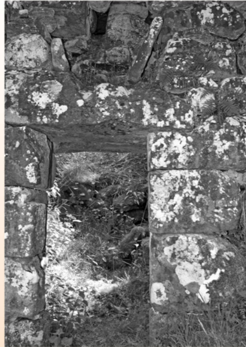
Boghead doorway, external surviving two stones of relieving arch; outlet of a 'quenching hole', for dousing of fires lit outside