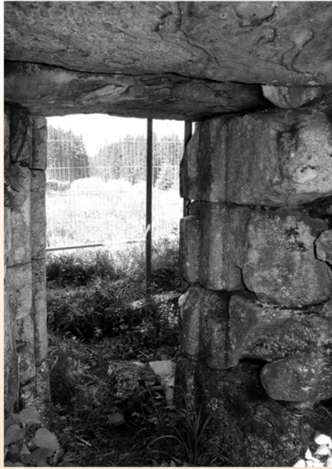
Boghead doorway, internal checks (rebates) for two doors, two draw tunnels; drawbars c 100mm square, built in during construction