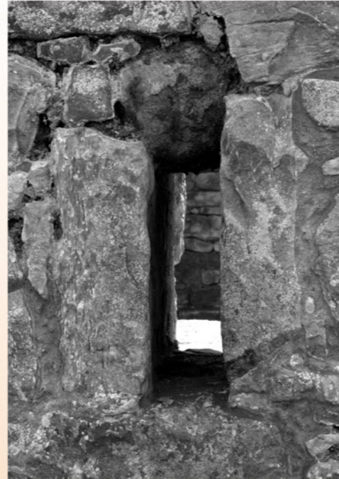
Black Middens 1 ventilation slits