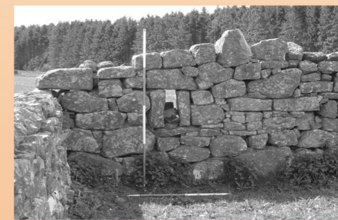
Highfield 1 one of 3 possible bastles at this site; some original foundation survives; fragments of worked stones found on site and in farm buildings; on private land