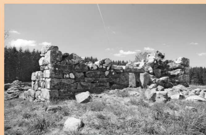
Shilla Hill sections of all 4 walls survive; 2009 consolidation work. Scheduled Ancient Monument; public access on foot only through forest