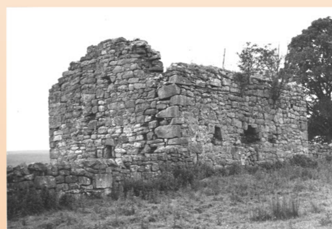
South Gatehouse building roofless by 1970; original walls in poor condition; front (south) wall rebuilt to incorporate windows and doorways; partly rebuilt by owners in 1992; Scheduled Ancient Monument, Grade 2 listed; privately owned