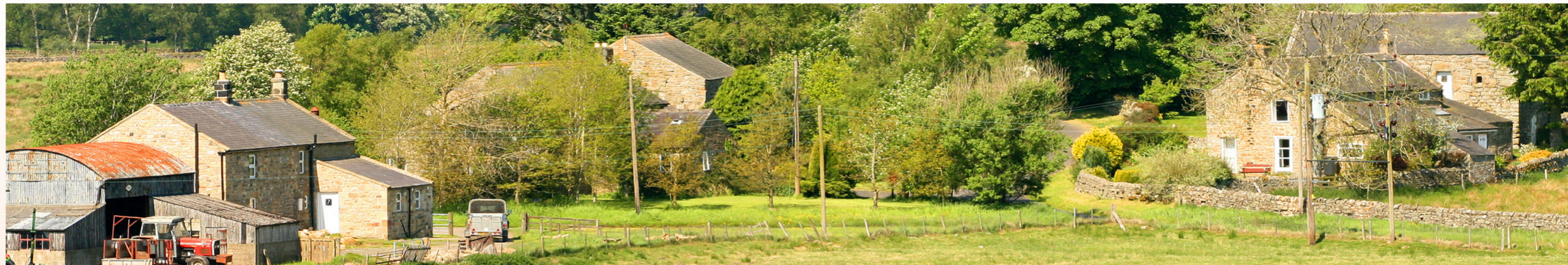
Gatehouse Bastle hamlet two bastles survive with walls intact; a third forms part of a field wall; foundations and base courses survive in the fourth; all buildings privately owned

Not one of Tarsset's bastles survives in its original form. A few were modernised to make more comfortable dwellings or adapted for other purposes, usually farm buildings. A number were occupied or in use until the 19th century. In most cases, bastles have been used as a source of stone for other buildings or dry-stone walls.