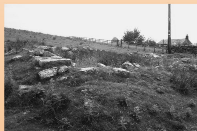
Burnmouth 2 second bastle at this site; walls have been robbed, probably for other buildings on site; on private land