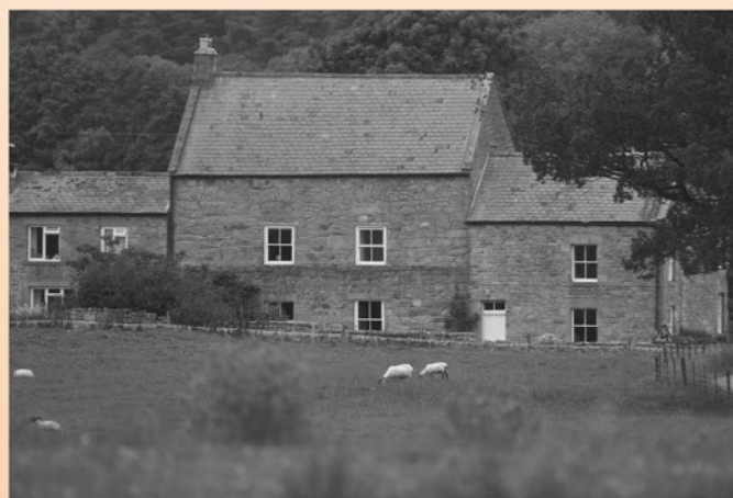
Snabdaugh an atypical bastle design with second floor vaulted stone ceiling below more modern slate roof; Grade 1 listed; now a private house

Most bastles stand singly and are south facing, but in Tarsset there are also clusters of two or more. At Gatehouse there were at least four bastles, possibly five.