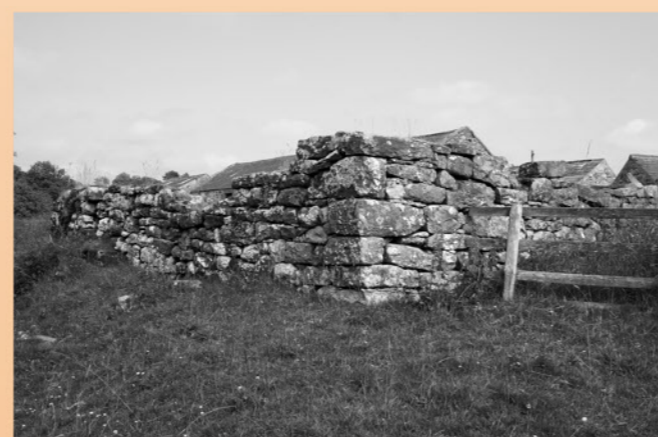
Burnmouth 1 first bastle at this site, incorporated in boundary wall; on private land, this view from public road