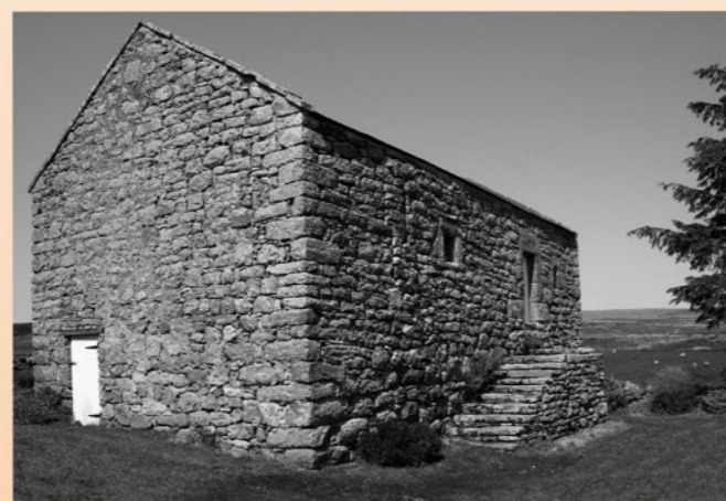
North Gatehouse intact masonry with external stairs in two sections; re-roofed in slate; later doorway on ground floor; blocked upper doorway at back led to former hay loft; Scheduled Ancient Monument, Grade 2* listed; privately owned